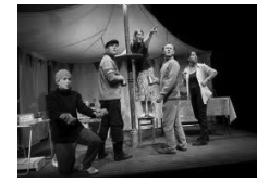
Plumley Village Hall - 5th March.

The Rural Touring Arts production at the village hall on Saturday March 5 th was a play based on the book by Brian Viner performed by the Pentabus Company from Shropshire to a packed village hall. It portrayed a family's move from suburban Crouch End to rural Herefordshire with all the upheaval involved and time taken to settle and feel accepted. Set in a village with the backdrop being a marquee used for the village fete with produce and white elephant stalls, the five actors slickly changed between characters and delivered some hilarious lines which had the packed village hall audience chuckling. Very professionally performed and an enjoyable evening – most relevant to a village hall audience!